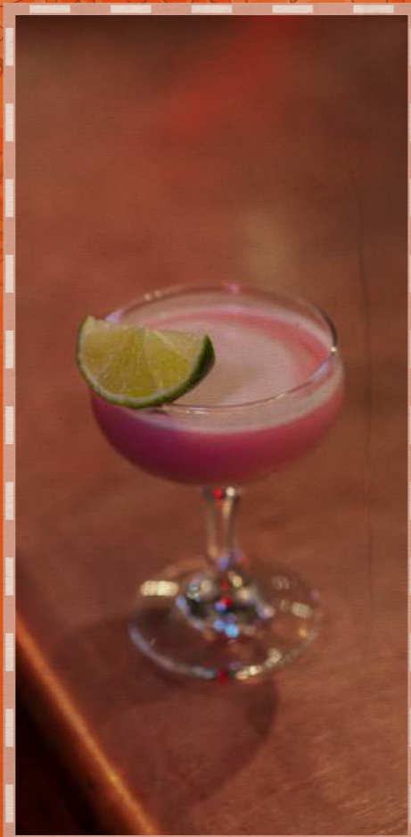
COCONUT & RASPBERRY MARGARITA