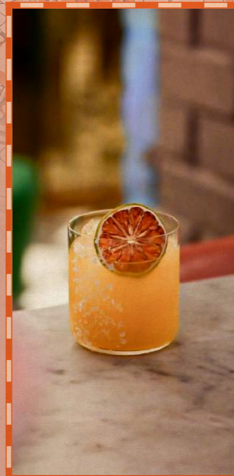
MANGO TO MEXICO